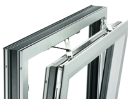
12 Concealed tilt-and-turn drive with locking function