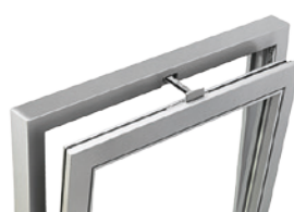
14 Concealed motion chain drive