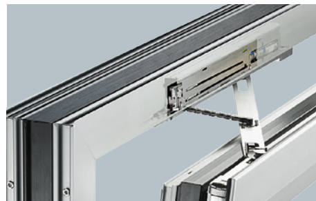
WINDOW DRIVE FULLY CONCEALED IN THE FRAME PROFILE.