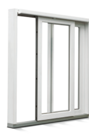
10 Drive system for sliding elements