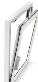
16 Motorised handle for tilt-and-turn as well as parallel action windows