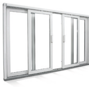
8 Drive system for lift & slide elements