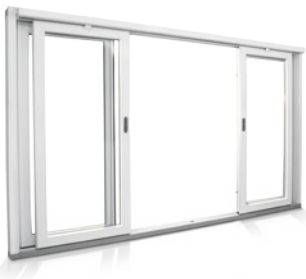
6 Partly concealed drive system for lift & slide elements

objects easily accessible and fresh air a matter of course. They are a clear statement for the new ease of living, for life-long room comfort and for an elegant design. Thanks to their compactness, the drives are fully concealed and adapt harmoniously to every type of requirement.