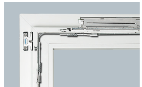
ELECTRIC LOCKING AND UNLOCKING AND TILTING.